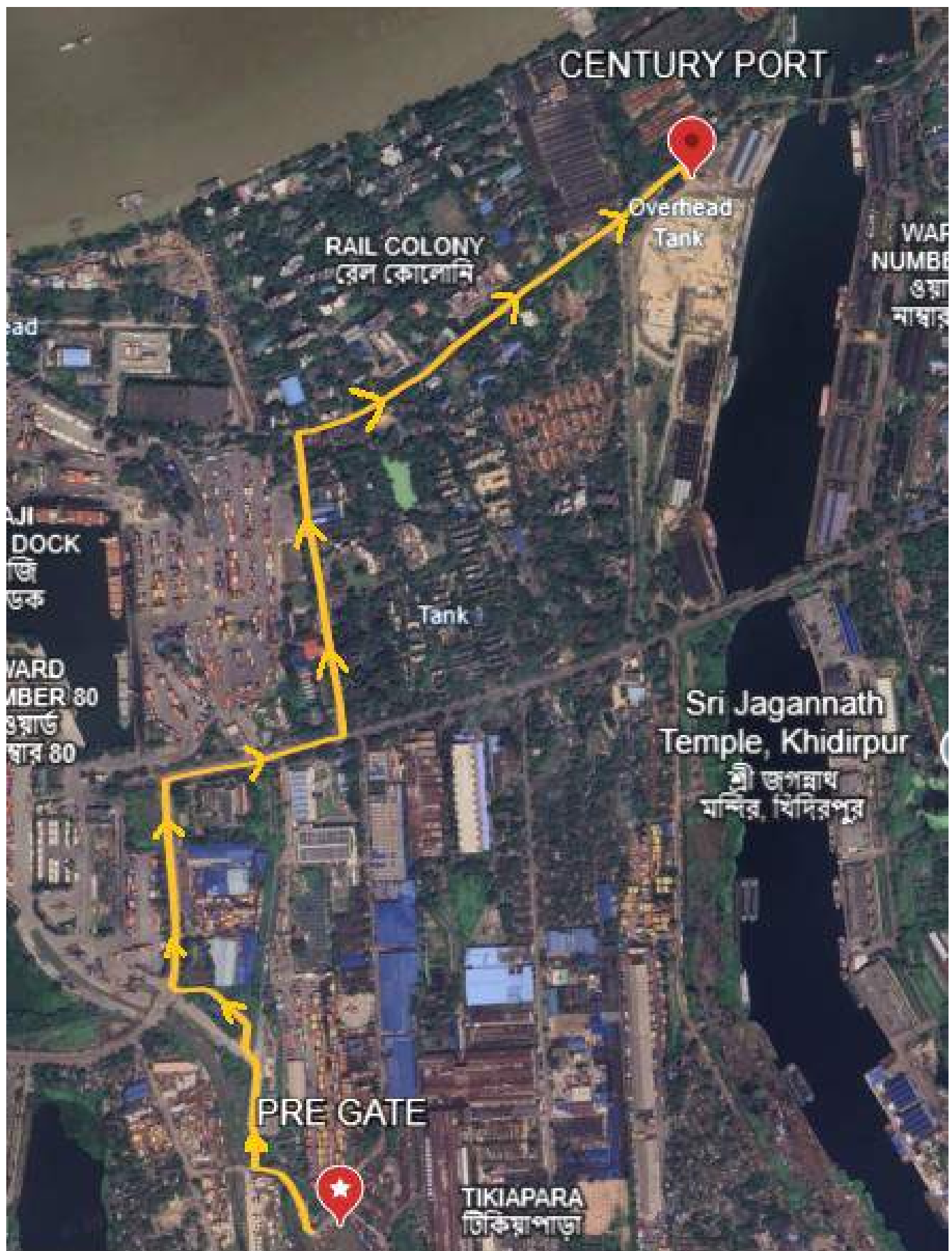
PRE GATE TO CENTURY PORT